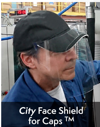
City Face Shield for Caps™

Holds with integrated fasteners (no hardware required)