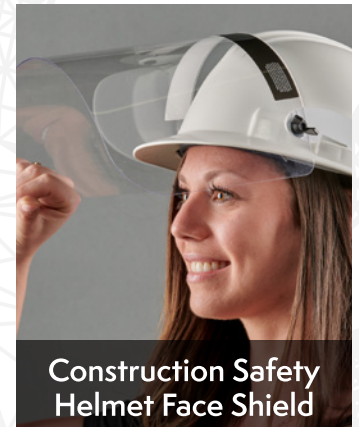
Construction Safety Helmet Face Shield

Minimum order of 50 units Provide your logo