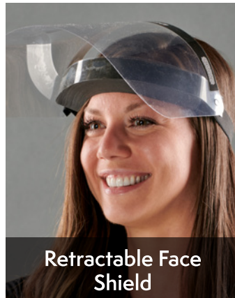
Retractable Face Shield

Very comfortable neoprene frontal support