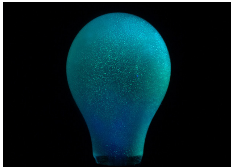
PAX-100 ELECTROSTATIC SPRAYER