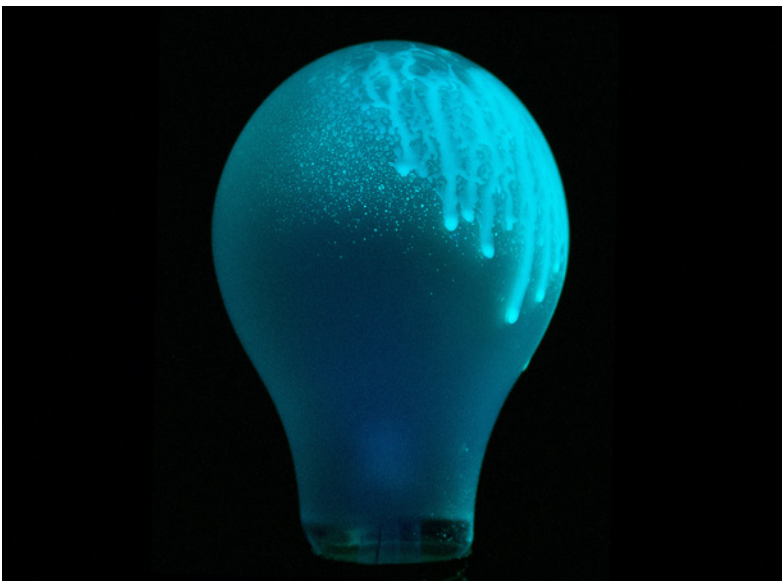
MANUAL SPRAY BOTTLE